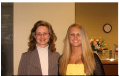
$1000 Community Scholarships were awarded to four High School Seniors.